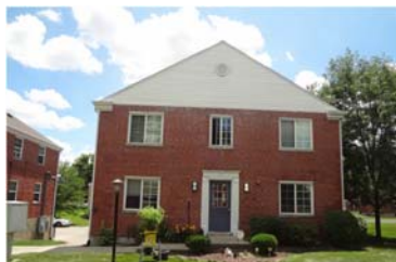
514 & 520 Telford