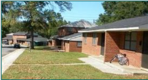
Civic Park in Salisbury, NC will be converting assistance through RAD

Whether you are asked to move temporarily due to rehab work or to move permanently to new replacement housing, the PHA will help you find the best possible option for you and cover your moving expenses.