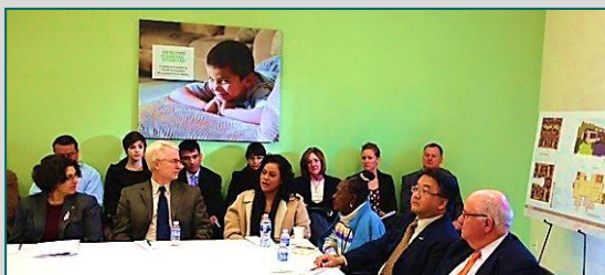
Roundtable conversation with Fresno Housing Authority residents about a RAD conversion