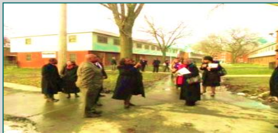
HUD Assistant Secretary Sandra Henriquez touring a property proposed for RAD in Cleveland, OH

Public housing units across the country need more than $26 billion in repairs. HUD refers to these repair costs as capital needs . Congress has not provided enough funding for PHAs to keep up with capital needs. As a result, PHAs have had to make tough choices between things like repairing roofs and replacing plumbing—or worse, demolishing public housing. RAD provides PHAs a way to rehabilitate , or repair, units without depending on additional money from Congress.