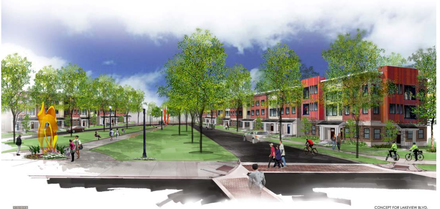
Pictured above—a proposed street extension of Lakeview Avenue and rendering of a redeveloped DeSoto Bass