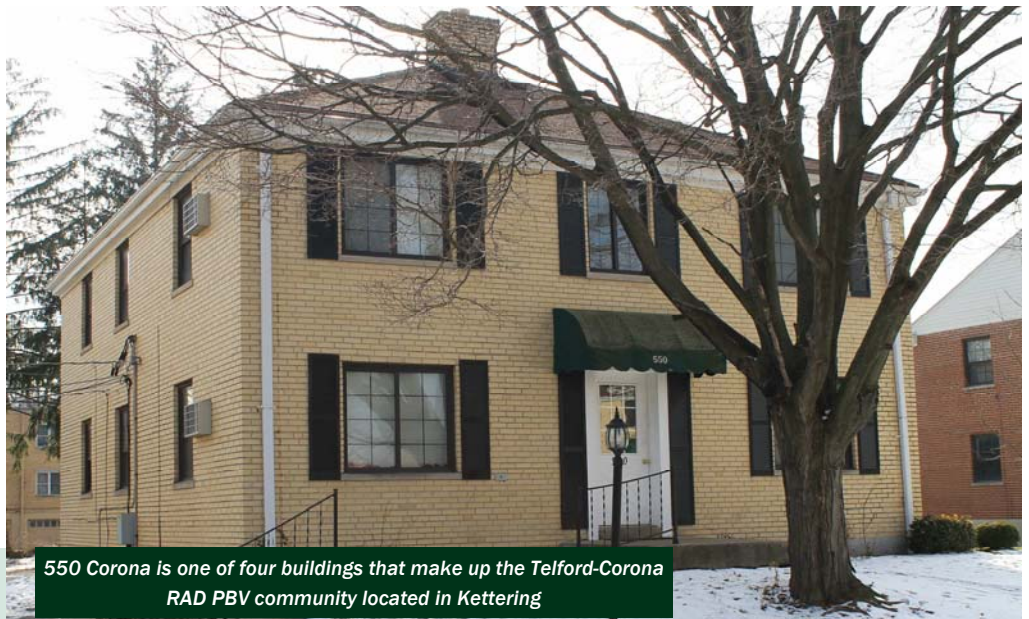
550 Corona is one of four buildings that make up the Telford-Corona RAD PBV community located in Kettering